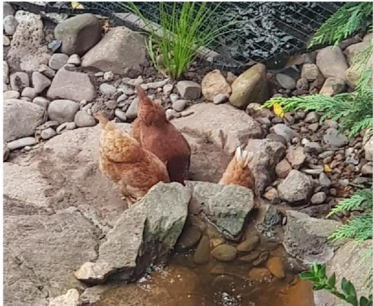
Ruby showed the ladies how to climb and drink from the waterfall.