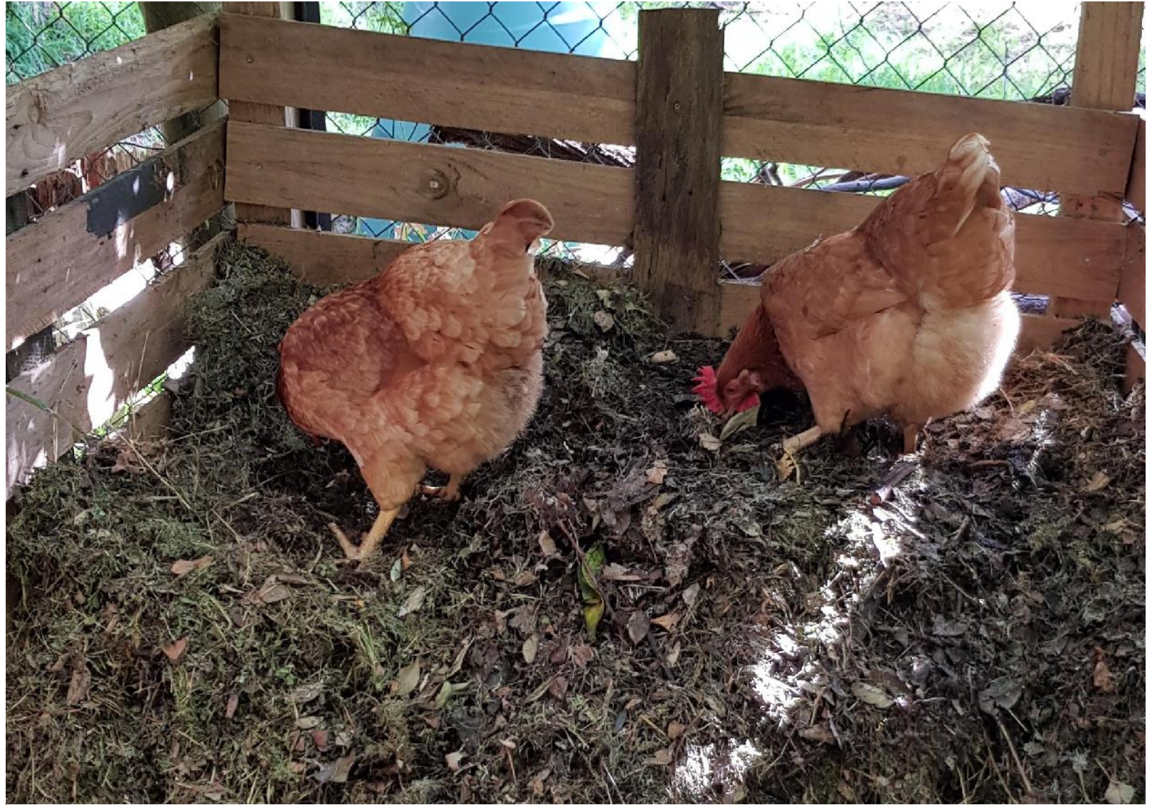
The ladies showed Ruby how to climb and do 'all you can eat' dinner in the compost.